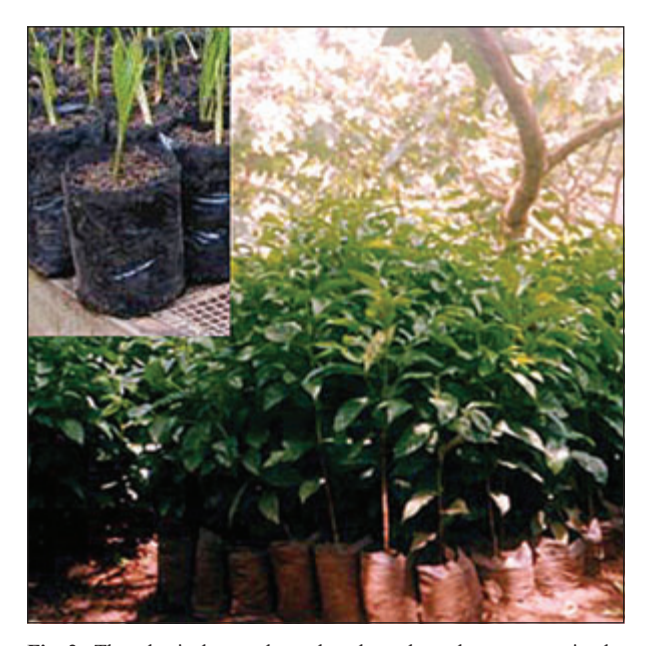
Fig. 2. The plastic bags where the plants have been grown in the nursery.

dial calipers and to the nearest 01 mm with measuring tapes after observing. After taking all the measurements frogs were released. After taking out all the eggs they were measured. After that all the eggs were kept the same place. Headlights were used at night (red color light).