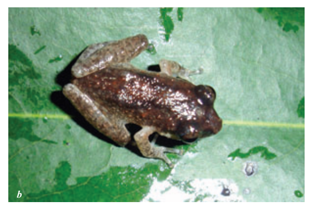
Fig. 1. Philautus regius. a, Mature male (lateral view), Nilgala forest in Sri Lanka (not collected); b, regius. Mature female (dorsal view), Nilgala forest in Sri Lanka (not collected).